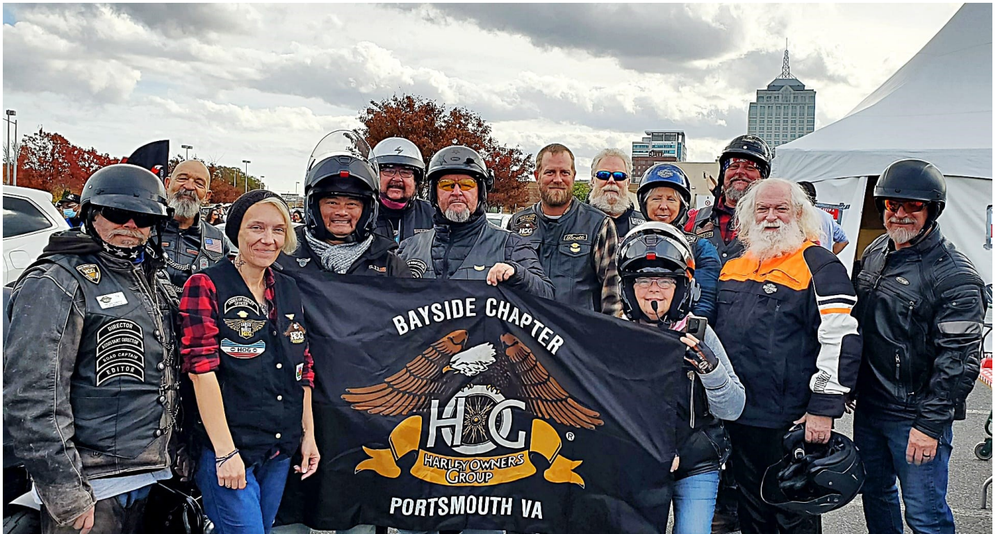
Bayside HOG participating at Mayflower Marathon Food Drive for Thanksgiving!